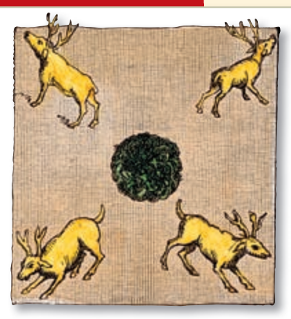
The totem, or tribal symbol, of the Iroquois